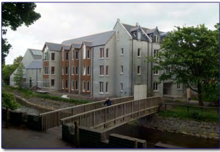
The Bayhead Bridge Centre (photo right and left) Hosted Region 9's September Meeting and was the base for the Whole Trip.